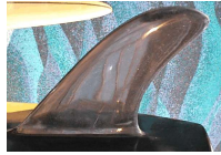
Figure 18 1966-1968